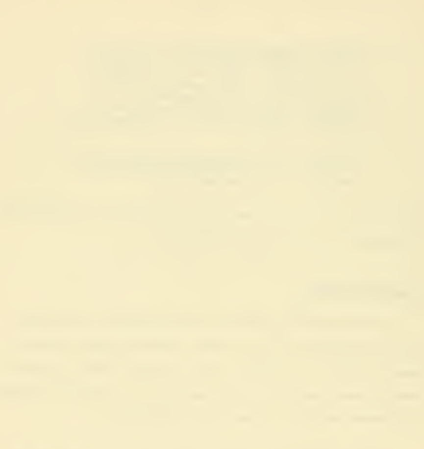
and the second